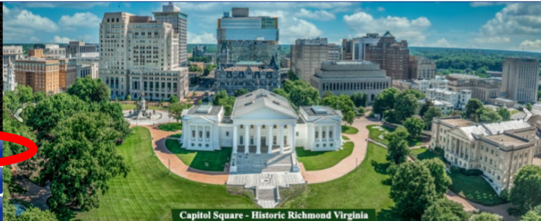
Capitol Square - Historic Richmond Virginia